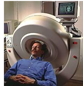
Brain Scan Machine

Marketing's use of these new devices has been called 'neuromarketing'. Yet it is really just an extension of the use of pupilometers , galvanic skin response , eye tracking , voice stress analysis and earlier brain wave measures – each heralded in its time as a revolutionary breakthrough. Despite hype by consultants offering these earlier technologies, none of them ever really found widespread, lasting use in marketing ( although eye tracking has carved out a small niche ).