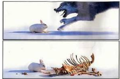
Incongruity humor (anon.)

Most humor trades on uncertainty and the large majority of ads that are humorous tickle our funny bones through the use of incongruity 2,3 or in other words, deviation 4 from expectation.